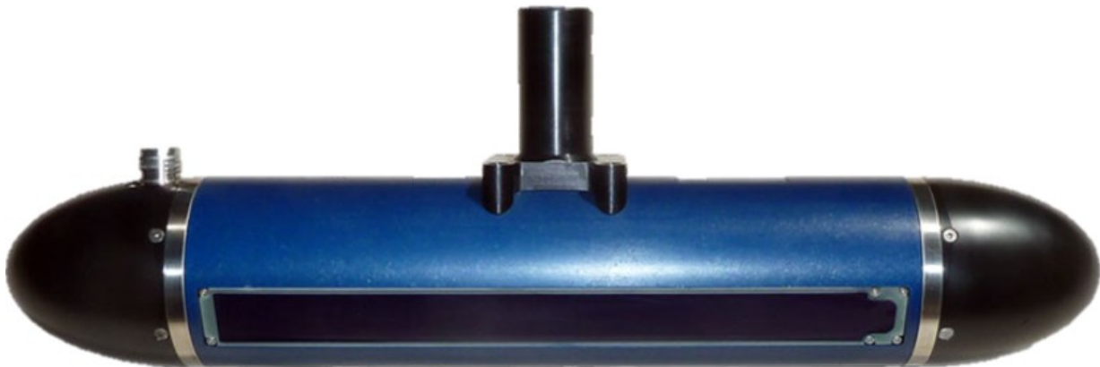
Ping DSP 3DSS-DX-450 Portable 3D Sidescan Sonar

Seattle – Ping DSP has named SUBSEA 20/20, Inc. the first authorized sales agency to represent their new line of 3D Sidescan sonar systems. After several years of research, product development and testing, Ping DSP recently introduced the first true 3D Sidescan. Ping DSP's 3DSS sonar is based on patented Computed Angle-of-Arrival Transient Imaging (CAATI) technology which provides high resolution 3D point cloud images over the entire water-column including the seafloor, complex structures and mid-water targets. Unlike interferometric sidescan which resolves one blended angle-of-arrival at each range sample, CAATI resolves multiple simultaneous angles-of-arrival and separates seafloor returns from sea surface, water-column and multipath interference. The result is true 3D Sidescan and is ideally suited for a wide variety of underwater mapping and imaging applications including shallow water bathymetry, search and recovery, structure inspection, habitat mapping, and water-column target detection.